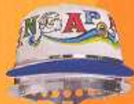
Cap frame Regular